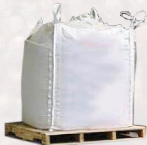
Super bag = 2,000 lb