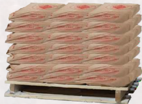
Pallet = 40 bags