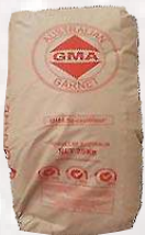
Bag = 55 lb