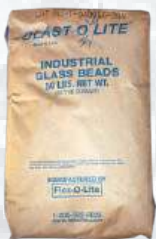
Bags = 50 lb