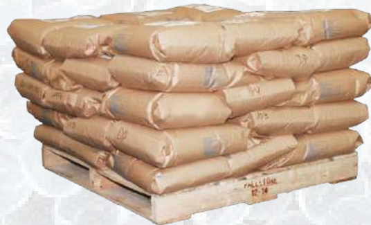
Pallet = 40 bags