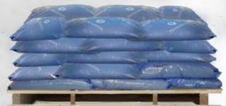
Pallet = 40 bags