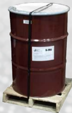
Drum = 1,700 lb