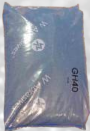
Bag = 55 lb