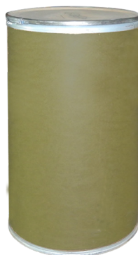
Fiber drum = 250 lb