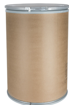
Drum = 1,700 lb