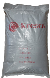
Bag = 55 lb