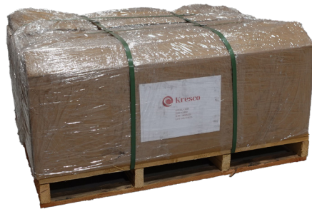
Skid = 40 bags