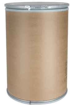
Drum = 1,700 lb