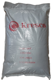
Bag = 55 lb